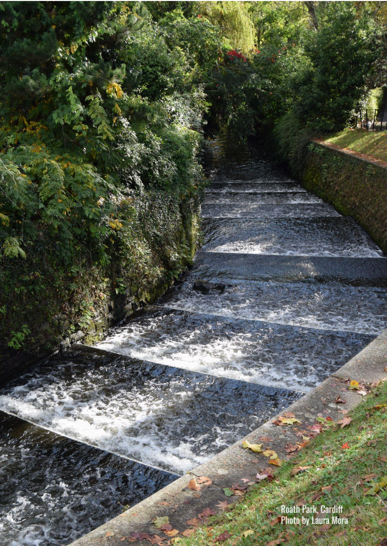
Roath Park, Cardiff